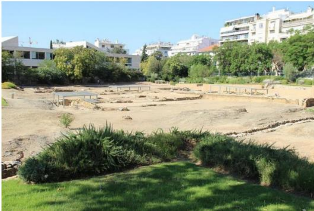
Fig. 2. Gymnasia of Athens and Lykeion.