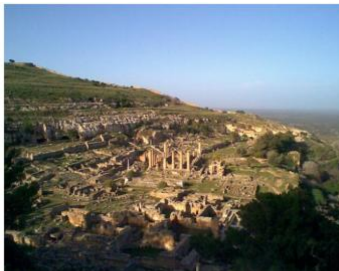
Fig. 1. Ruins of Cyrene, present-day Libya.

He created the Lyceum of Athens (336 BC) (see Fig. 2), where many free classes were offered. Aristotle conveyed his concept that the universal was always found in some way in the individual and particular, for which there would be a single reality, made up of individual things, generating the conceptual basis on the universality of science. In Nicomachean Ethics , his best-known work on ethics preserved to this day, written in 349 BC, Aristotle emphasized the importance of observation and experience to be a good doctor and not just a philosopher: "The doctor is not made exclusively for the study of the texts".