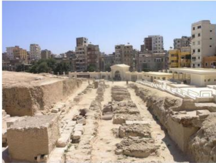
Fig. 5. Ruins of the Serapeum of Alexandria, where the Library of Alexandria moved part of its collection, after running out of storage space in the main building.

In its beginnings, Greek doctors learned from Egyptian surgeons. The study of human anatomy began there with Herophilus of Chalcedon (335-280 BC), himself a disciple of Praxagoras of Cos. Praxagoras, together with his disciple Erasistratus of Cos (310-250 BC) (see Fig. 6), grandson of Aristotle, founded the first Department of Anatomy in history, with records of the practice of vivisection with animals and criminals. Herophilus, who is recognized as the father of anatomy, was a great anatomist, comparable only to Vesalius, and the first to carry out a systematic dissection of the human body [29].