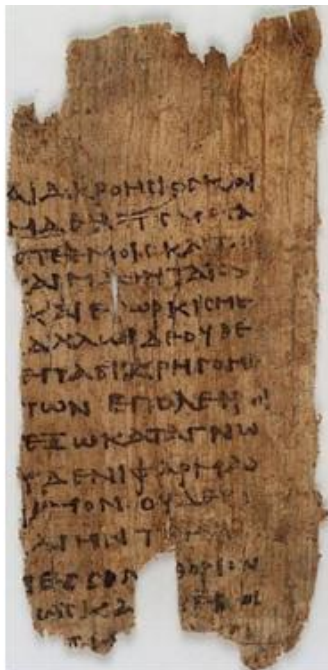
Fig. 4. Text on papyrus: fragment of the Hippocratic Oath.

During this time, the ethical duties of physicians became relevant and were written in the Hippocratic Oath (see Fig. 4). A commitment to act ethically and honestly with patients was established. Therefore, we can consider the Hippocratic Oath as "the fundamental document of Western medical ethics and the canonical text of medical paternalism" [26].