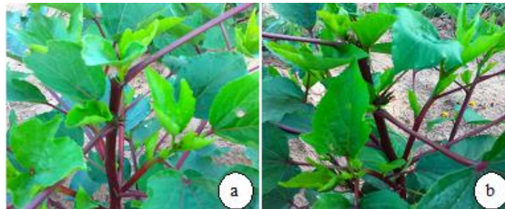
Fig. 4(A-B). Emergence of new secondary branches on cut plants a week later