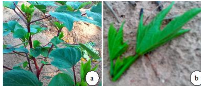
Fig. 3. (a) Emergence of secondary branches on an uncut plant, (b) End of apex cutting