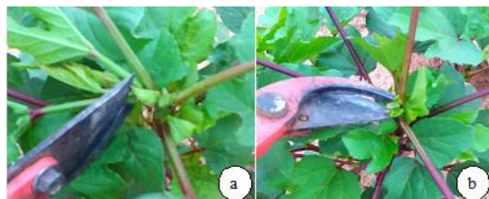
Fig. 2(A-B). Apex cutting technique with pruning shears