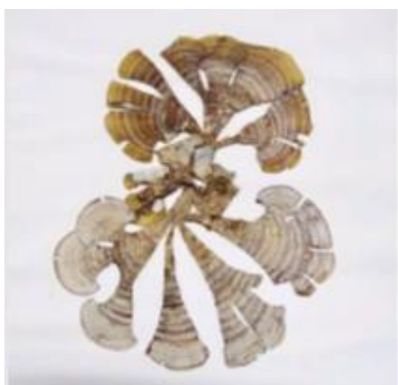
Fig. 2. Seaweed Padina sp.

Padina sp. can grow in clear waters to waters with a depth of 15-20 meters [30]. It grows in coastal waters where the substrate is sandy, slightly muddy, attached to rocks, attached to dead coral fragments, and sometimes attached to other macroalgae [29]. Padina sp. can live well at salinities in the range of 30-34%. And a good