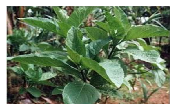
Fig. 1. Vernonia amygdalina

Three strains of Candida albican : SC5314, P37005 and RM1000 were collected from Federal Istitute for Industrial Research Oshodi (FIIRO), Lagos, Nigeria. They were subjected to sugar fermentation test as described by John et al. [6]. Germ tube test was carried out to identify and differentiate them from other species which was done according to Cheesbrough [7] . Their molecular characterization was also carried out to confirm the identity of the strains [8].