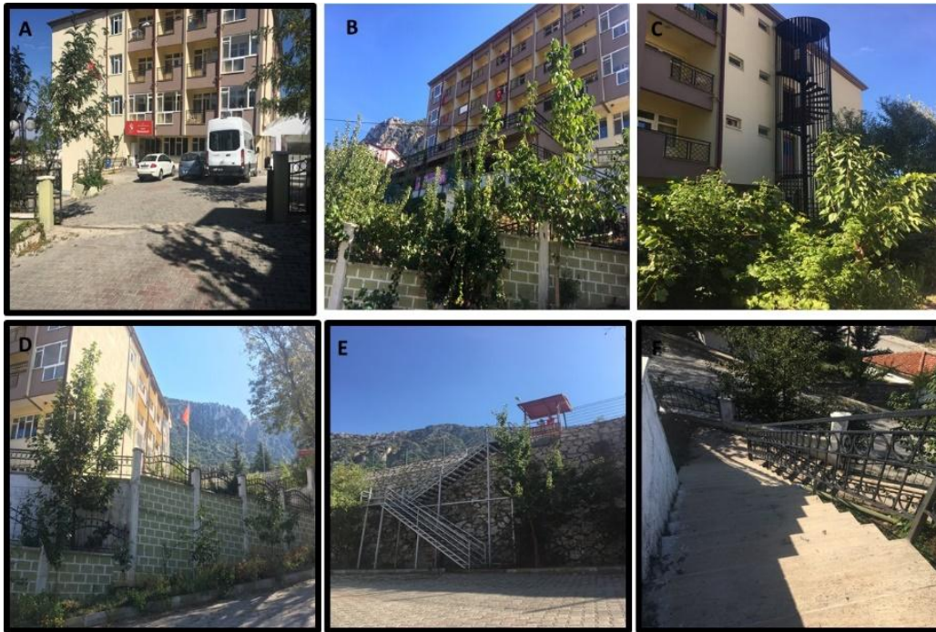
Fig. 2. General view of Egirdir Nursing Home (A: Main entrance way to the building, B: Outside view, C: Fire escape, D: Exterior walls, E: Stairs leading to the intercity road, F: Stairs leading down to the lower garden)