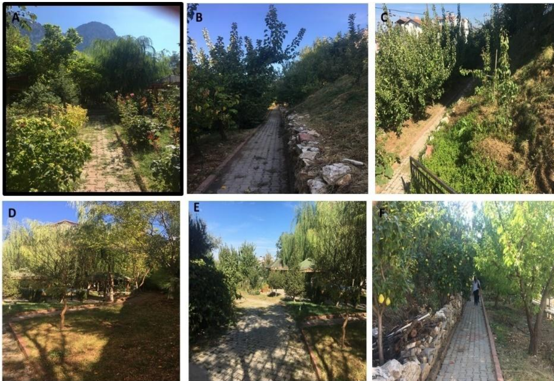
Fig. 4. Appearance of Egirdir Nursery House's garden (A, B: Ornamental plants on the side of walking path, C: Aromatic plants near the stairs, D: Some ornamental plants, E: Leafy trees, F: Fruit trees)

Similarly, the success level of features (%) was determined according to equation given in Materials and Methods section and assessments have been given in Table 2.