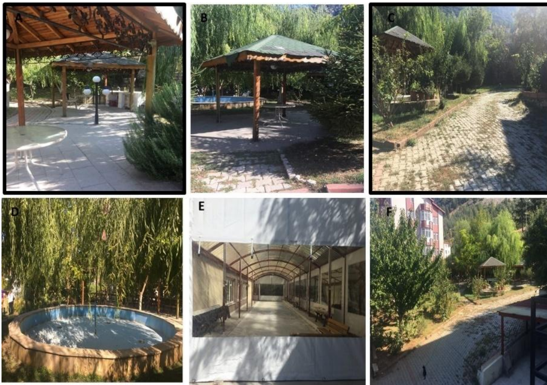
Fig. 5. Some garden objects, elements and design specifications (A, B, C, F: Seating elements for resting and watching the environment, D: Pool, E: Specially reserved area for games and activities)