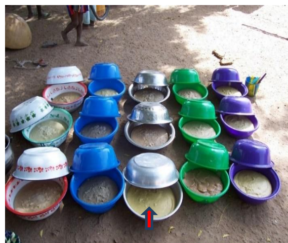
Photo 4. Good properties of N'Tenimissa in preparation