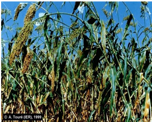
Photo 1. N'Tenimissa, tan guinea tall plant

The direct crosses of local cultivars of Guinea race (Red and purple plants) with improved cultivars of Caudatum race (tan plant) resulted in a series of improved guinea race type of lines with "tan" plant, and white grain. Sorghum plant colour refers to the visible pigmentation where plant tissue is wounded. In sorghum, three primary plant colours are: red, tan, and purple. The new improved lines have a loose panicle and a high number of grains per panicle (Photos 1 and 2).