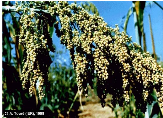
Photo 2. N'Tenimissa with loose panicle and a high number of grains per panicle

They were also characterised by long glumes and hard grain. Thus, N'Tenimissa, the first white seeded, "tan" plant, straw-coloured glume, photoperiod sensitive sorghum cultivar was developed and released in Mali. This new improved "tan" variety has the best features of guinea race of sorghum and it is high yielding (Table 1). It has a white endosperm and a thin pericarp. "Tan" plant is critically characterised for producing sorghum grain with acceptable food quality. White seeded "tan" plant type sorghums, also referred as food-grade sorghums [8], have been developed through breeding for inherently improved sensory attributes of foods produced from them, such as light colour, and blend taste and flavour, compared to sorghums with a pigmented pericarp and white tannin [9,10,11,12]. White seeded tan-plant sorghums have a white pericarp, tan-plant colour and straw or tan coloured glumes, and their endosperm texture ranges from hard to medium [11] and [13].