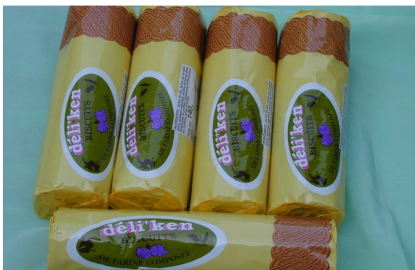
Photo 5. Biscuit Deliken manufactured by Général Alimentation du Mali (GAM)

Consumer preference tests of biscuits made of composite flour indicated that the most preferred biscuits contained up to 20% sorghum flour. Biscuits with 30% and 40% sorghum flour were acceptable for texture, colour, and odour. For shelf life, there is no difference between the different biscuits. From the various organoleptic parameters studied, it was revealed that biscuits made with 20% sorghum flour were better in compared to biscuits of 30% and 40% of sorghum. Based on this fact, it is worthwhile to mention that the food processing company named 'Générale Alimentation du Mali' (GAM) decided to manufacture a biscuit called Deliken (Delicious Keninke) containing 20% of sorghum flour and 80% wheat flour (Photo 5). Our results are in accordance with those reported by Olatunji et al. [16] who indicated good quality bread can be baked with blends containing either 20% sorghum or 15% maize flour. Higher substitution levels were found possible with the use of