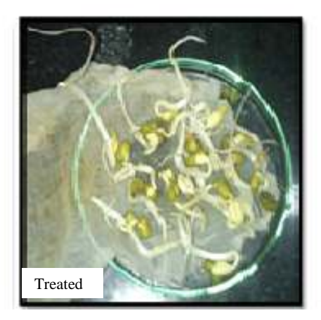
Fig. 1. Seedling growth of radio frequency cold plasma treated mung beans after 24 h of germination [12]