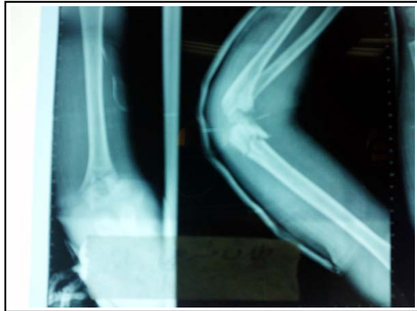
Fig.1A: Displaced humerus supracondylar fracture in a 5 years old patient.