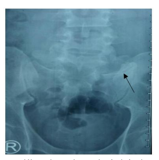
Fig. 2. (Case 2): Lumbosacral X ray shows abnormal articulation between the L5 transverse process and the medial aspect of the left ilium consistent with Bertolotti's syndrome with Castellvi's type Ila LSTV (labelled by arrow)

Case 2: A 43 years old otherwise well and healthy Malay gentleman who works as a presented to Hospital gardener outpatient orthopaedics clinic with lower back pain for 5 months which worsened in the past 2 weeks. It was a dull aching on and off localised pain which was aggravated by strenuous activities and relieved upon rest. There was no weakness or numbness of bilateral lower limbs. No history of antecedent fall or trauma and no bladder or bowel incontinence. There was no history of prolonged cough; loss of appetite; loss of weight or tuberculosis contact. On examination, there was no midline spinal tenderness. There was mild tenderness over left lower paraspinal muscles. Neurology of bilateral lower limbs was normal. Straight leg raising test over bilateral lower limbs was normal. Inflammatory markers were within normal limits. Lumbosacral x ray showed abnormal articulation between the medial aspect of the left ilium and the L5 transverse process consistent with Bertolotti's syndrome as shown in Fig. 2. Patient was started on analgesics like tramadol and paracetamol and referred physiotherapist for back strengthening exercises. He was reviewed in clinic after 3 month and 6 months and currently patient is otherwise well and pain control is adequate and he is able to do daily activities and work without much difficulties.