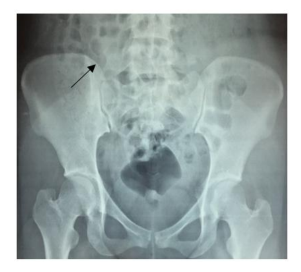
Fig. 1. (Case 1): Lumbosacral X ray shows abnormal articulation between the L5 transverse process and the medial aspect of the right ilium consistent with Bertolotti's syndrome with Castellvi's type Ia LSTV (labelled by arrow)

Case 1: A 23 years old well and healthy Malay lady who works as a clerk presented to Hospital Melaka emergency department for treatment of lower back pain for 1 year which worsened in the past 1 week. It was a dull aching on and off localised pain which was aggravated by prolonged standing and relieved upon rest. There was no weakness or numbness of bilateral lower limbs. No history of antecedent fall or trauma and no bladder or bowel incontinence. There was no history of prolonged cough; loss of appetite; loss of weight or tuberculosis contact. On examination. there was no midline spinal tenderness. There was mild tenderness over right lower paraspinal muscles. Neurology of bilateral lower limbs was normal. Straight leg raising test over bilateral lower limbs was normal. Inflammatory markers were within normal limits. Lumbosacral x ray showed abnormal articulation between the medial aspect of the right ilium and the L5 transverse process consistent with Bertolotti's syndrome as shown in Fig. 1. She was admitted to orthopaedics ward and started on analgesics like celecoxib and methylcobalt and referred physiotherapist for back strengthening exercises. Subsequently, the patient was discharged on second day of admission and upon review in clinic after 1 month, 3 month and 6 months and currently patient is otherwise well and pain control is adequate and she is able to do daily activities and work without much difficulties.