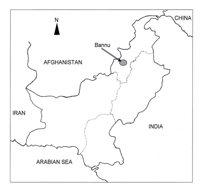
Fig. 1. Map of Pakistan showing the study area in Khyber Pakhtunkhwa

The study was carried out in Bannu District ( 32^{\circ} 43' - 33^{\circ} 06' N; 70^{\circ} 22' - 57' E), Khyber Pakhtunkhwa (KPK), Pakistan (Fig. 1). The Kurram and Gambila rivers traverse Bannu district and provide water for irrigation as well as inevitably forming breeding grounds for malaria vectors. Mean daily temperatures range between 10.8^{\circ}C - 32.9^{\circ}C . The study area experiences two rainy seasons: in March and during the summer monsoon that occurs in July and August [11].