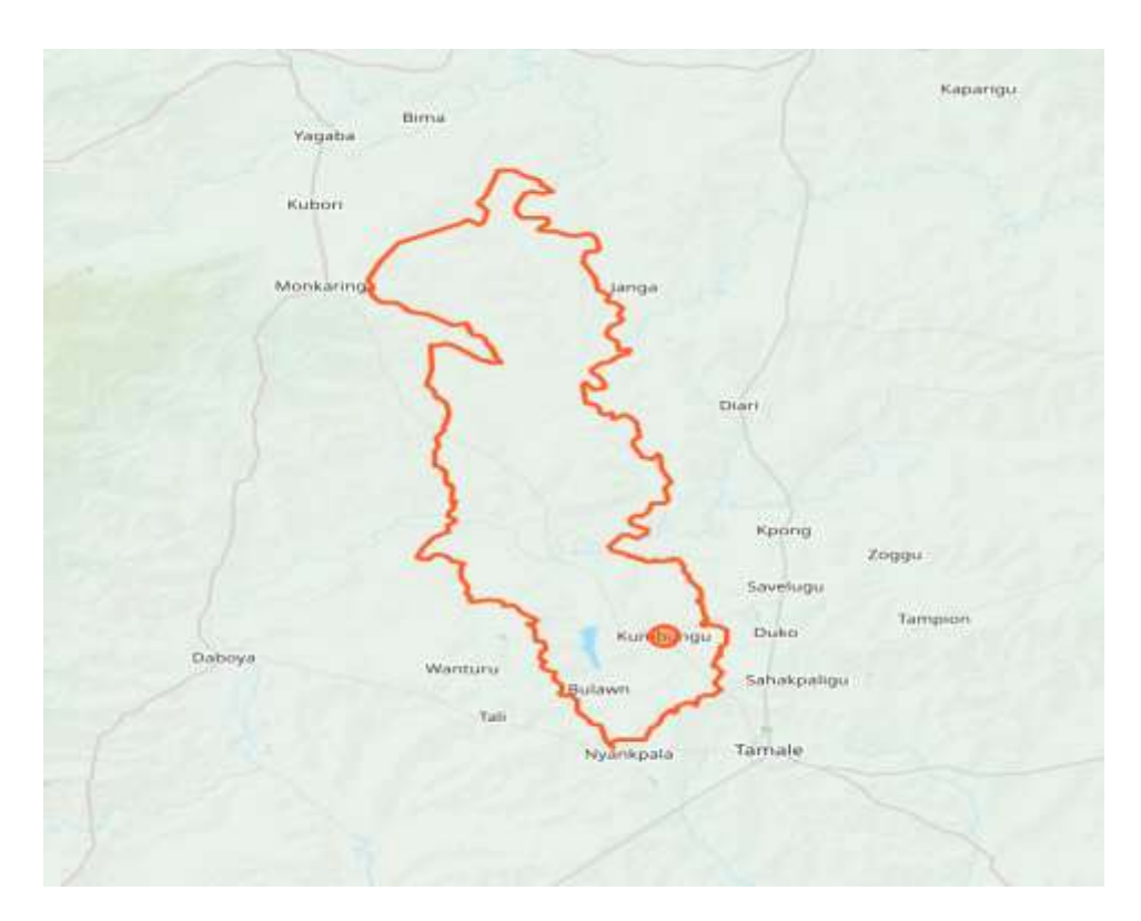
Fig. 1. Map of Kumbungu District.

utilized for all data entries, coding and convections. The information gathered through interviews and personal observations were qualitatively and quantitatively examined. Descriptive statistics was used to analyze and present the productivity levels of pepper production with the aid of tables, bar charts and frequency distributions. Gross margin, Net margin and Return on Investment (ROI) were used to analyze the profitability of pepper production in the study area, with the following formulae: