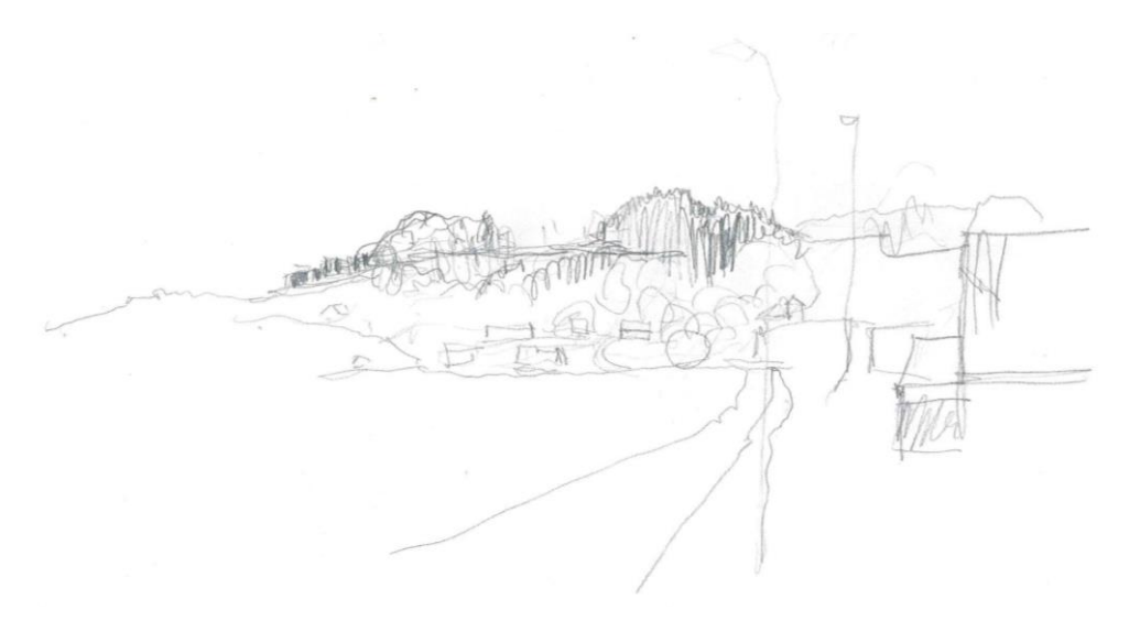
Figure 6. Ingfrid Lyngstad, Vennesborg : framing silhouette changing from recreational area to housing and sprawl (2022, NO).

Drawing is employed as a tool beyond its mere aesthetic value of documenting a landscape's beauty but as an instrument to capture the impact of local planning processes. For the landscape architect Ingfrid Lyngstad, drawing can become a documentation of "collective grief". The negative changes enacted on specific landscapes symbolized the omitted parts of the participation process. Lyngstad used drawings as part of a case study to show what the characteristic elements were and how they were going through phases of change (see Figure 6). In this case, the initial silhouettes set the basis for the narratives and values that appeared while studying these places [13].