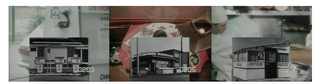
Figure 7. Jef Cornelis, Rijksweg N°1 : gas station, still 0:13:45; brothel, still 0:15:12; chips shop, still 0:16:43 (1978, BE).

Filippo Romano's Statale 106 photographic project has been unconsciously outlined since his childhood, during numerous trips organized by his family to travel from Milan to Calabria and Sicily, the places of his ancestors. This project, an ongoing and perhaps never-ending personal assignment, started in 2007. Through Statale 106 , Romano documents and narrates the broken relationship between the South and the Italian government. It is a story about the "promises, the half-promises, the failed industrial experiments [29]" led by the national government in its attempt to create jobs and improve southern Italy's living conditions [29] (see Figure 8).