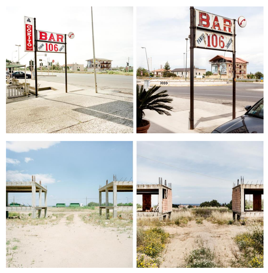
Figure 8. Filippo Romano, Statale 106 . Two images taken over time documenting changes in the built and natural landscape along the road. (2009–2019, IT).

For Romano, photography becomes a form of assessing and critically analysing conflicts' social and political dimensions and how they are spatially revealed. His work depicts these Italian "new peripheries", often portrayed only by maps built from data through geographic information systems. Romano's work introduces an alternative cartography of a specific area through photographs. Romano aims for his work to be remembered as a neutral and observational gaze that contains personal "drifts" that are more poetic, reflecting curiosity and knowledge and his way of interpreting. He observes cities, and he documents them [29].