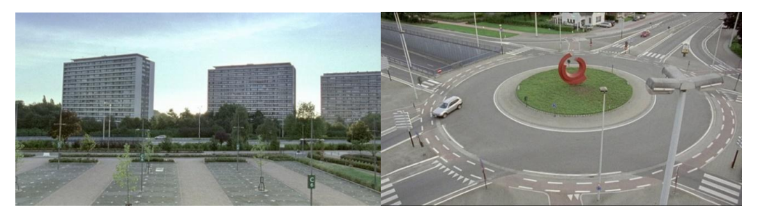
Figure 3. Felix Van Groeningen, With Friends Like These: still 0:09:10; still 0:19:07 (2007, BE).

Van Groeningen regards the settings as an essential element that he employs to indicate, mirror, or magnify the feelings, experiences, and connections of the characters. Van Groeningen explains how he created and stressed the feeling of loneliness and emptiness in With Friends Like These by making use of the setting: "there was so much grey or silver in the image, and the towers, the apartment that was big and empty, and a roundabout that is even uglier. (...) the shiny, that emptiness, that is what we exaggerated. There are almost no people in the image, you almost never see other people or other cars, really being alone and empty in that city [30]" (see Figure 3).