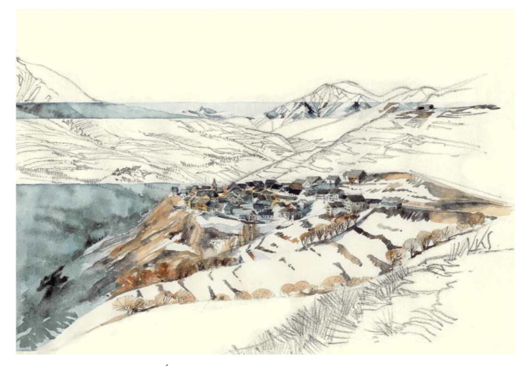
Figure 1. Véronique Simon, Écrins national park (2004, FR).

The selected photographers explore the "less picturesque" dimensions of the built and unbuilt landscape, focusing on different types of subjects and employing various techniques. Gabriele Basilico recurred to a method that attempted to "isolate" built elements