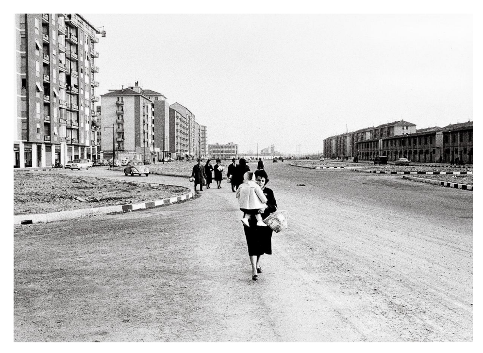
Figure 5. Ernesto Fantozzi, Via Inganni, Milan (1962, IT).

struggle to cope with and adapt to living in a metropolis. He captures the buzzing streets, the crowded trains during rush hour, the new neighbourhoods being built, and the leisure activities of the inhabitants of the city's periphery.