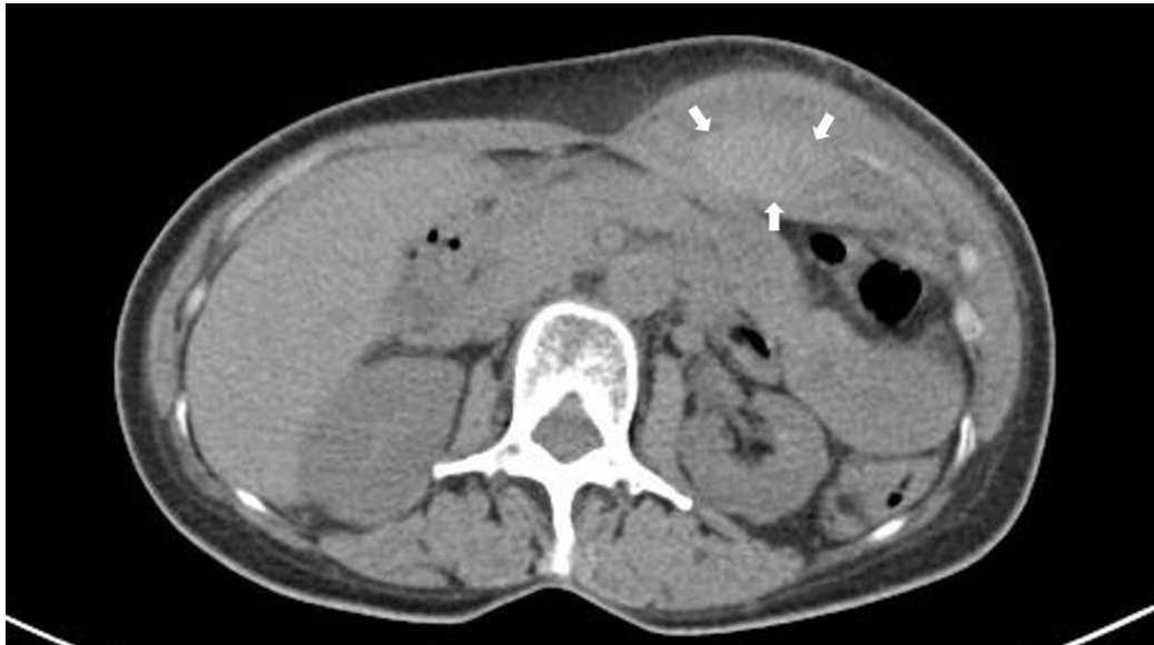
Fig. 2. Axial view of patient's abdomen computed tomography revealed a rectus hematoma