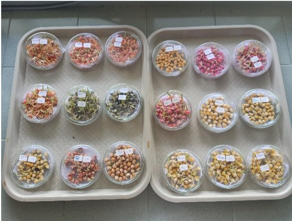
Picture 1. Eighteen treatments (variety) were selected for trials in this study