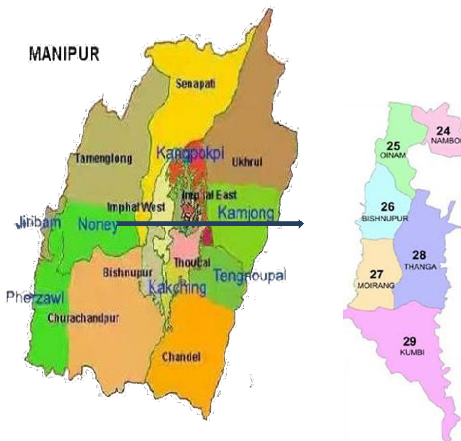
Fig. 1. Schematic representation of Bishnupur district of Manipur

The primary data relevant to the objective of the study have been collected through survey method using pre tested schedules. The secondary data were collected from different reports and publication of the state government offices, journals, books and reliable sources.