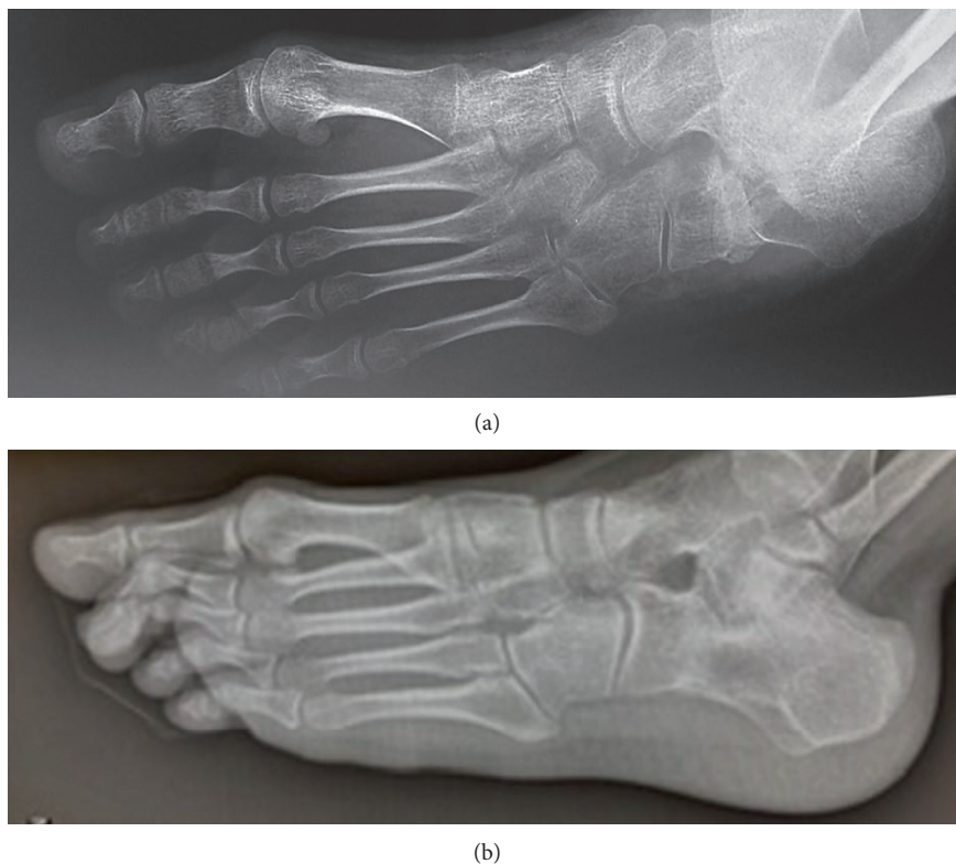
FIGURE 2: Same patient of Figure 1, three years later. The patient was surgically treated by Evans–Mosca procedure bilaterally with an interval of six months. The radiographic examination of the left foot, performed in oblique view 3 months after surgery, showed good lengthening of the calcaneus with the presence of the tricortical bone graft (a). At an intermediate follow-up, 7 years later, the graft was perfectly remodeled in the calcaneal bone with the maintenance of calcaneal lengthening and without any sign of osteoarthritis of the calcaneocudoid joint (b).