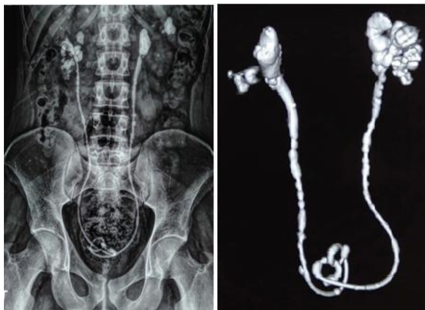
Fig. 1. Calcified double J ureteral stent

The patient remained out of sight. 3 years later, he came with bilateral low back pain without fever associated with hematuria. The clinical examination revealed a patient in good general condition, hemodynamically stable. Temperature was 37.1 C. Bilateral lumbar pain on palpation. An unprepared urinary tree x-ray and the uroscan showed calcified bilateral double J stents along their entire length (Fig. 1). Urine analysis was sterile. The diagnosis of calcification of the bilateral double J ureteral stent was made. Management was by endoscopic approach in two sessions. The first step consisted of laser fragmentation of the distal loops (in the bladder) and right side double- J stenting (Figs. 2). The second step consisted of fragmentation of the left sided lithiasis. The postoperative follow-up was simple. After grooming (Fig. 3), lithiasis remains at the renal level, an endoscopic management is planned.