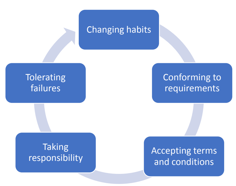
Fig. 1. Elements of customer cooperation with SSTs

Not Supportive : However, some respondents were dissatisfied with the help received by organization staff. Respondents described some service organizations as irresponsible, at the very least without responding to a customer call. Others criticized automated voice recordings given as responses to customer inquiries, stating that they are incredibly irritating.