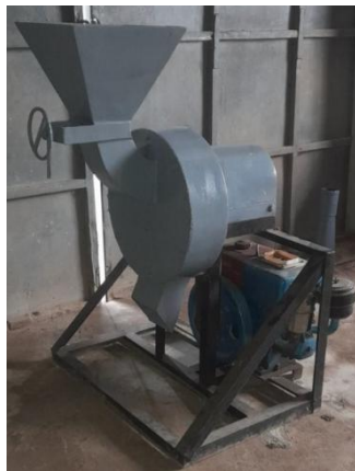
Fig. 3. Picture of the Developed Hammer Mill