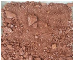
Fig. 1. Sample of laterite

“Laterite is a highly weathered material, rich in secondary oxides of iron, aluminium, or both. Laterites are produced when there is an intensive and long lasting tropical rock weathering which is amplified by high rainfall and elevated temperatures. We must also note that they are an important source of many metal ores, particularly nickel, cobalt, manganese, iron and aluminium” [1].