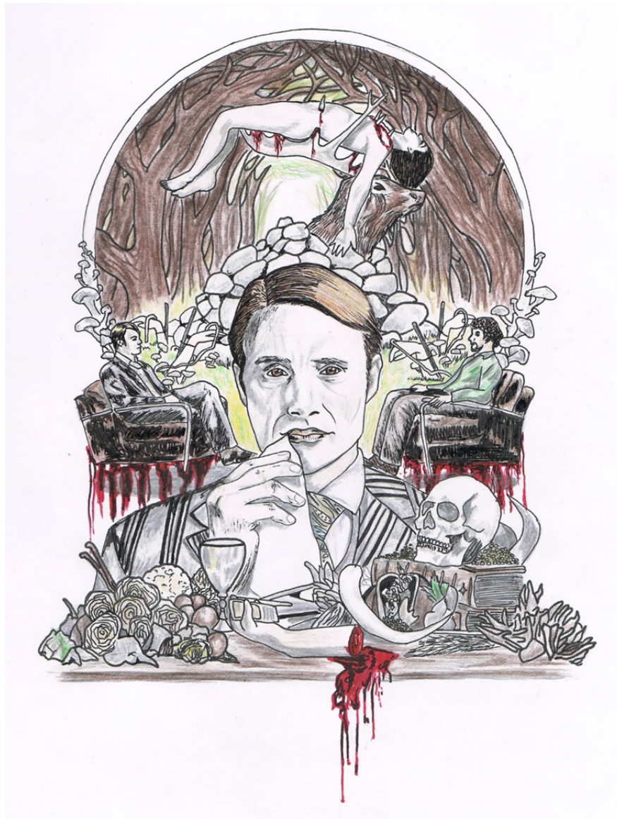
Figure 1. Artistic Creativity: A Concept Art by Hussein Al-Bayati.

For centuries, there have been numerous studies on human intelligence and its measurement, the Intellectual Quotient (IQ); these studies have managed to extrapolate an excellent estimation of an individual's intelligence, for example, the use of Wechsler's scale to measure the IQ (Bayley, 1957; Guertin et al., 1962; Guertin et al., 1966; Seashore et al., 1950). There have also been similar attempts to quantify the creativity and the creative potential of an individual in a similar sense, using the an analogous quotient known as the Creativity Quotient (CQ) (Bossomaier et al., 2009; Furnham et al., 2008; Romey, 1960; Piffer, 2012; Snyder et al., 2005). However, none of these attempts seems to be successful although there have been some promising studies focusing on alternative modalities to assess creativity, including cerebral and cranial morphometry (Bendetowicz et al., 2016), the neural correlates of creativity (Amir, 2016), functional MRI imaging (fMRI) and the assessment of divergent thinking potentials (Kleibeuker et al., 2016), and other studies (Allen and Loughnane, 2016; Amir & Biederman, 2016; Bendetowicz et al., 2016; Kleibeuker et al., 2016; Oscoz-Irurozqui & Ortuño, 2016).