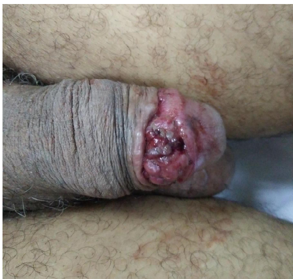
Fig. 1. Penile nodular lesion

He was in good general health. The PSA level was 12 ng - ML and a normal appearance of the penis (Fig. 3).