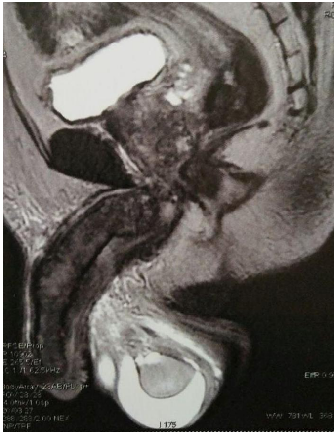
Fig. 2. Pelvic MRI showing involvement of cavernosae corporea and spongiosus