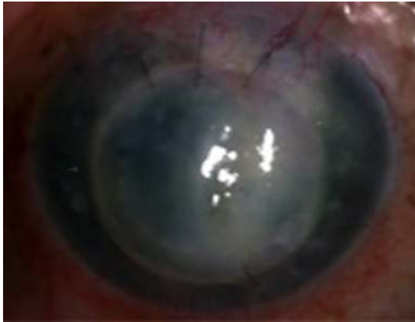
Fig. 3. Slit lamp photo at 1 month illustrates increase scarring in the graft