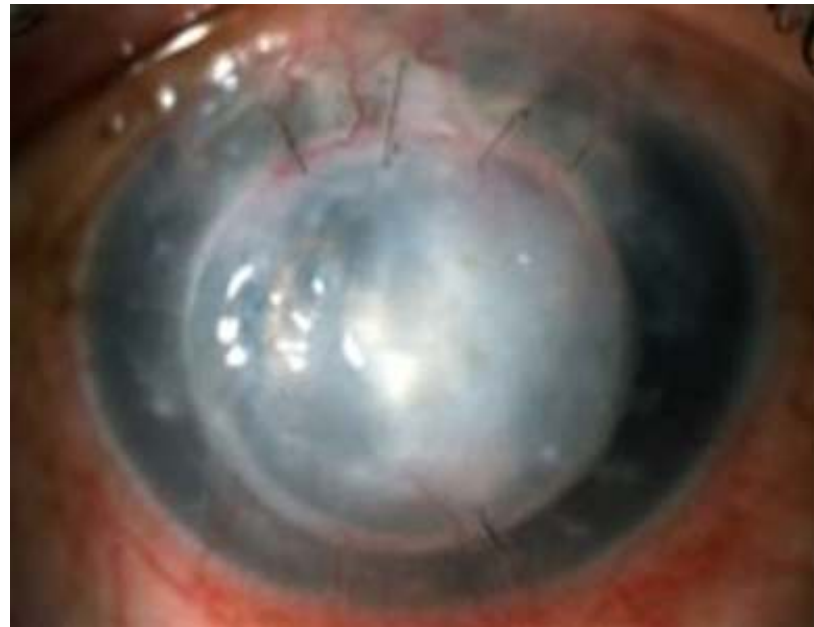
Fig. 4. Slit lamp photo at 4 months shows scarring of the entire graft