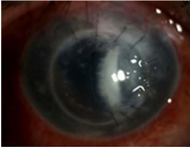
Fig. 1. Slit lamp photo on consultation reveals a hazy graft with an intact corneal epithelium with multiple white, branching needle-like deposits located in the anterior to midstroma surrounded by clear cornea temporally and hazy cornea nasally. The conjunctiva was slightly hyperemic with 5 loose sutures and some stromal vessels approaching the sutures at the temporal graft-host interface

eye was to do a penetrating keratoplasty but the patient did not consent for the procedure. At 4 months, the corneal graft was fully scarred (Fig. 4).