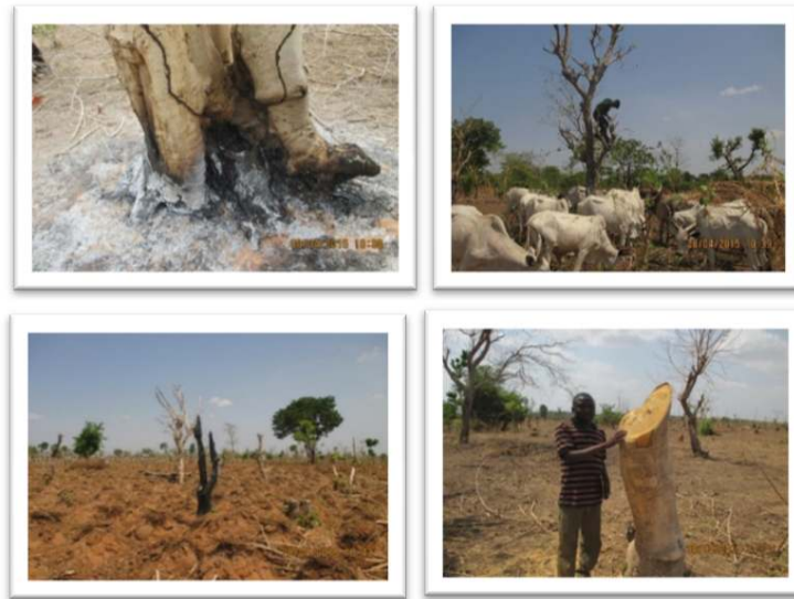
Picture 1. Human activities in Doma forest reserve