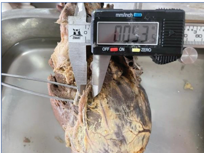
[Table/Fig-3]: Diagram showing measurement of diameter of GCV with the help of digital vernier callipers.

the authors found the presence of GCV on entire length of anterior interventricular sulcus in 13 (43.33%) cadaveric hearts whereas in 17 (56.67%) cadaveric hearts, the GCV was present in upper 2/3 part of anterior interventricular sulcus. There was only 1 (3.33%) heart, where the GCV was starting from the apex of heart, while in rest of