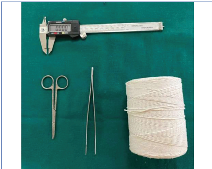
[Table/Fig-1]: Instruments used for measuring GCV.