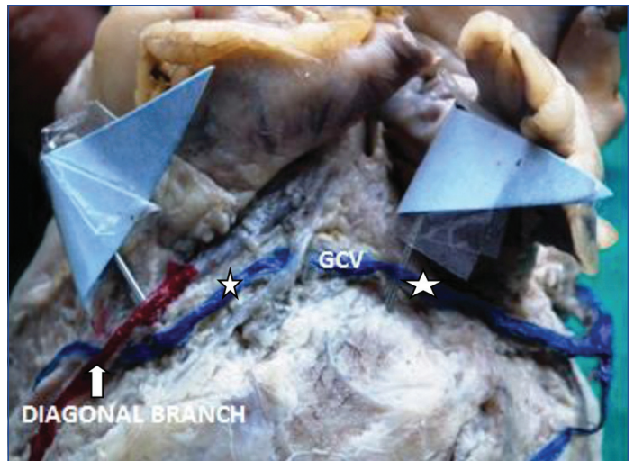
[Table/Fig-4]: Great Cardiac Vein (GCV) (white star) superficially crossed by diagonal branches (white arrow) of left coronary artery.

the hearts GCV start from anterior interventricular sulcus. Majority of GCV were straight but in 1(3.33%) heart GCV showed kinkings. The diagonal branches of left coronary artery were superficially crossed by GCV in 1(3.33%) heart [Table/Fig-4]. GCV was on left-side of anterior interventricular artery in 1 (3.33%) heart [Table/Fig-5].