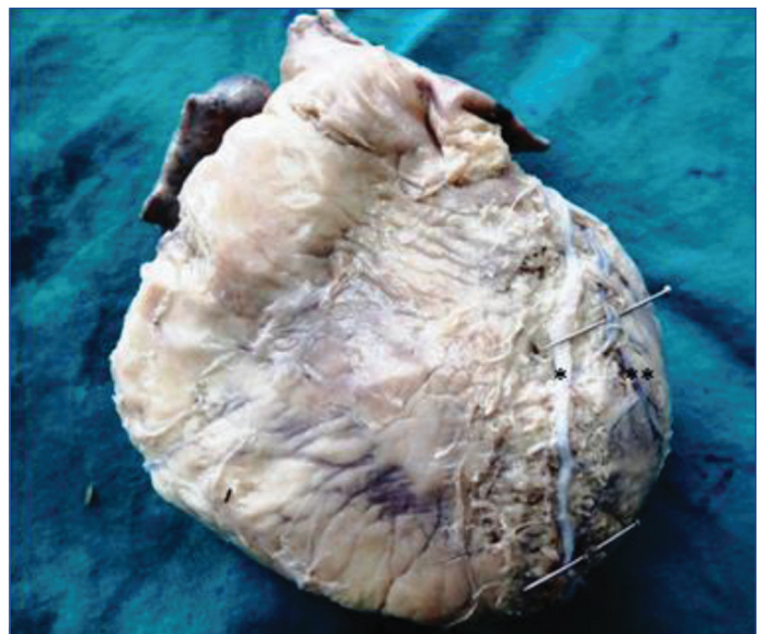
[Table/Fig-5]: Presence of Great Cardiac Vein (GCV) (single black star) on left-side of anterior interventricular artery (two black star) on sternocostal surface of heart.

The present study also revealed that Vieussens valve was present in 23 (76.66%) GCV. The mean length of GCV was 79.26 \pm 22.78 mm and the range of length was from 55.50 \pm 27.57 to 112.33 \pm 36.07 mm. The mean diameter of GCV was 2.85 \pm 1.32 mm and its range was from 0.8 \pm 0.41 to 4.2 \pm 1.16 mm. The statistical analysis also depicted the diameter of GCV is having significant variation in relation age of cadaver ( r=0.376 and p=0.0403 ) [Table/Fig-6].