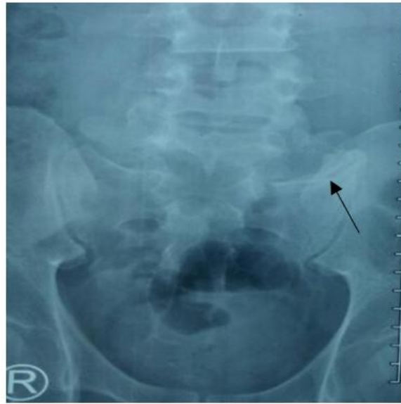
Fig. 2. (Case 2): Lumbosacral X ray shows abnormal articulation between the L5 transverse process and the medial aspect of the left ilium consistent with Bertolotti's syndrome with Castellvi's type IIa LSTV (labelled by arrow)

Case 2: A 43 years old otherwise well and healthy Malay gentleman who works as a gardener presented to Hospital Melaka outpatient orthopaedics clinic with lower back pain for 5 months which worsened in the past 2 weeks. It was a dull aching on and off localised pain which was aggravated by strenuous activities and relieved upon rest. There was no weakness or numbness of bilateral lower limbs. No history of antecedent fall or trauma and no bladder or bowel incontinence. There was no history of prolonged cough; loss of appetite; loss of weight or tuberculosis contact. On examination, there was no midline spinal tenderness. There was mild tenderness over left lower paraspinal muscles. Neurology of bilateral lower limbs was normal. Straight leg raising test over bilateral lower limbs was normal. Inflammatory markers were within normal limits. Lumbosacral x ray showed abnormal articulation between the medial aspect of the left ilium and the L5 transverse process consistent with Bertolotti's syndrome as shown in Fig. 2. Patient was started on analgesics like tramadol and paracetamol and referred physiotherapist for back strengthening exercises. He was reviewed in clinic after 3 month and 6 months and currently patient is otherwise well and pain control is adequate and he is able to do daily activities and work without much difficulties.