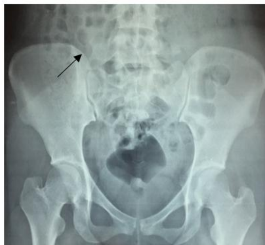
Fig. 1. (Case 1): Lumbosacral X ray shows abnormal articulation between the L5 transverse process and the medial aspect of the right ilium consistent with Bertolotti's syndrome with Castellvi's type Ia LSTV (labelled by arrow)

Case 1: A 23 years old well and healthy Malay lady who works as a clerk presented to Hospital Melaka emergency department for treatment of lower back pain for 1 year which worsened in the past 1 week. It was a dull aching on and off localised pain which was aggravated by prolonged standing and relieved upon rest. There was no weakness or numbness of bilateral lower limbs. No history of antecedent fall or trauma and no bladder or bowel incontinence. There was no history of prolonged cough; loss of appetite; loss of weight or tuberculosis contact. On examination, there was no midline spinal tenderness. There was mild tenderness over right lower paraspinal muscles. Neurology of bilateral lower limbs was normal. Straight leg raising test over bilateral lower limbs was normal. Inflammatory markers were within normal limits. Lumbosacral x ray showed abnormal articulation between the medial aspect of the right ilium and the L5 transverse process consistent with Bertolotti's syndrome as shown in Fig. 1. She was admitted to orthopaedics ward and started on analgesics like celecoxib and methylcobalt and referred physiotherapist for back strengthening exercises. Subsequently, the patient was discharged on second day of admission and upon review in clinic after 1 month, 3 month and 6 months and currently patient is otherwise well and pain control is adequate and she is able to do daily activities and work without much difficulties.