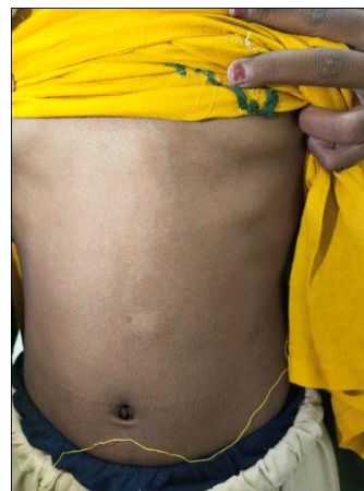
Fig. 1. Dilated veins present on anterior abdominal wall

Hepatic venous outflow tract obstruction, portal hypertension with liver parenchymal disease and multiple nodules? Dysplastic? regenerative. She was subjected to Triphasic computed tomography of abdomen which showed short segment narrowing of Middle hepatic vein and Right hepatic vein with left hepatic vein ostial narrowing suggestive of HVOTO with features of Liver parenchymal disease with portal hypertension and multiple nodules? dysplastic? regenerative (Fig. 4). Alpha fetoprotein was normal. CT guided targeted biopsy of Hepatic nodules was done with biopsy report suggestive of high grade dysplastic nodules. Upper GI Endoscopy showed features of early portal hypertension. For ruling out other causes of hypercoagulability like Protein C and S deficiency, AT III deficiency, Factor V leiden mutation, Prothrombin Gene mutation G20210A, Antinuclear antibodies, Antiphospholipid antibodies investigations were sent which turned out to be negative. As mentioned earlier, our patient was not on any oral contraceptive medication. After admission she was started on Mesalamine and Ganciclovir, her stools frequency reduced to 1-2 episodes per day without blood. Patient was also started on diuretics and anticoagulation. Patient was subjected to ostial dilatation of Right Hepatic Vein and Middle Hepatic Vein via balloon angioplasty and anticoagulation was continued after procedure.