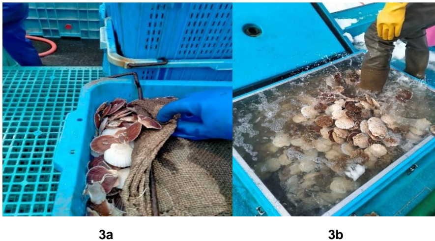
Fig. 3. (a) Young scallops to be shipped (b) Adult scallops to be shipped