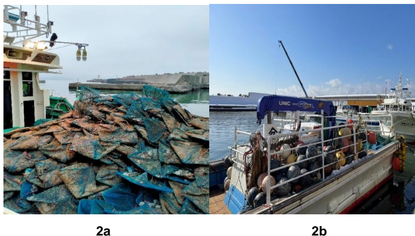
Fig. 2. (a) Nets that have been transported on the deck of a ship (b) UNIC Ocean Crane at Company X