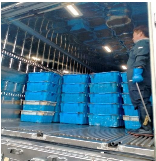
Fig. 4. Putting young scallops into the freezer truck for shipping