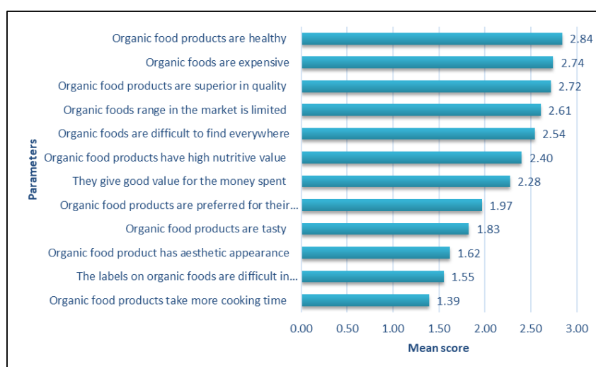
Fig. 1. Consumer perception towards organic food products

The information pertaining to the consumer perception towards various organic food products were analysed through 12 statements on a three-point rating scale with scale agreements of agree, neutral, disagree and accordingly scores of 3,2 and 1 were assigned respectively to the scale agreements. The results are shown in Fig. 1