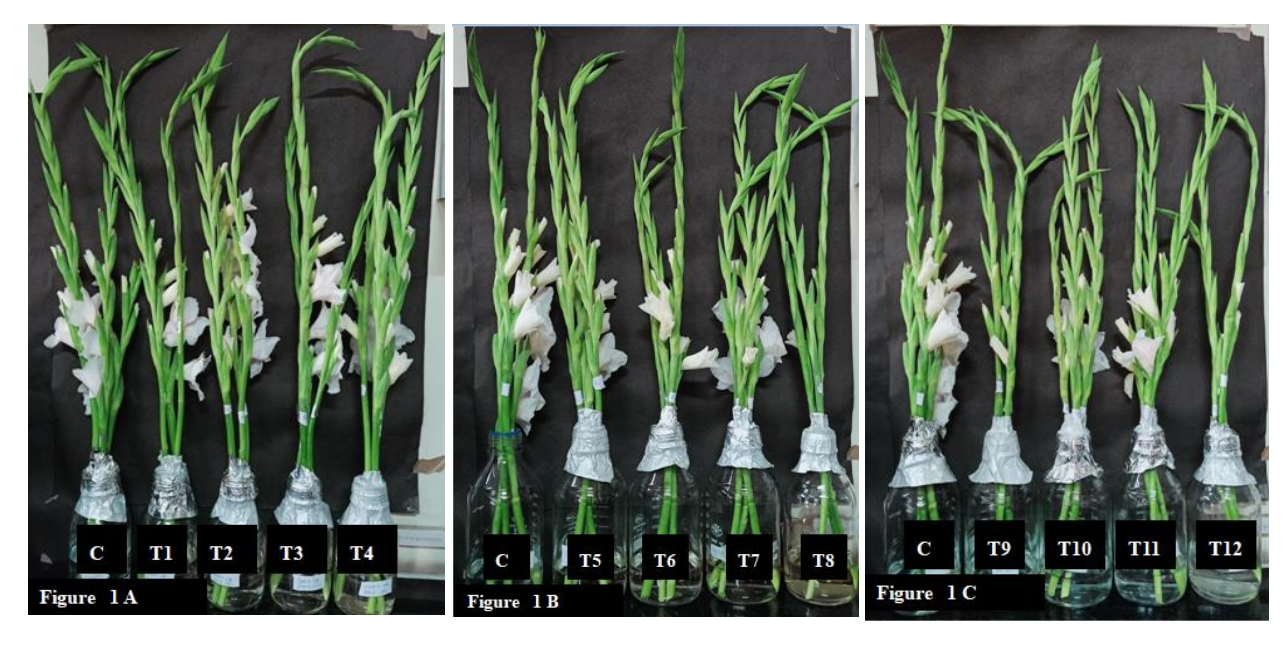
Fig. 1A. Gladiolus flowers variety Pusa Shanti with different treatments of Sodium nitroprusside Fig. 1B. Gladiolus flowers with different treatments of salicylic acid Fig. 1C. Gladiolus flowers treatments with combination of Sodium nitroprusside and Salicylic acid

Sharma et al.; J. Adv. Biol. Biotechnol., vol. 27, no. 1, pp. 211-224, 2024; Article no.JABB.113195