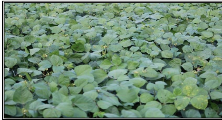
Fig. 2. 30 cm x 10 cm + 125 % RDF