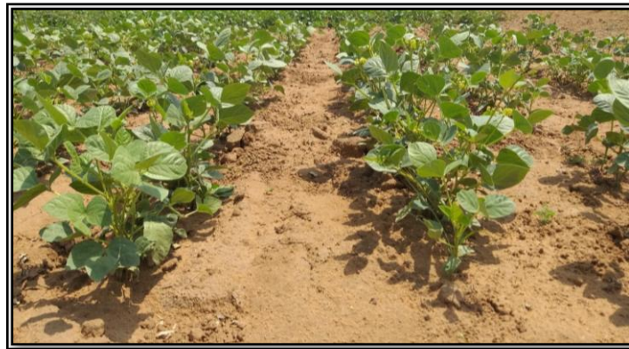
Fig. 1. 45 cm × 20 cm + 125% RDF

However numerically higher protein content (23.33 %) was found in 45 × 20 cm spacing (S 4 ) followed by 30 × 20 cm spacing (S 2 : 23.18 %). The lowest protein content (22.22 %) was noted with 30 cm × 10 cm spacing (S 1 ). The reason may be more competition between plants for growth resources like nutrient, moisture, light under narrow spacing that reduced protein content in seed. Similar results observed by Panchal [8], Patel [9], Patel [1] and Patel et al. [10] in mothbean and incase of protein yield in Table 1 showed that 30 × 10 cm (S 1 ) spacing gave significantly higher protein yield (256.10 kg/ha) but it was remained statistically at par with 45 × 10 cm (S 3 ) and 30 × 20 cm (S 2 ). This might be due to increased seed yield under 30 × 10 cm (S 1 ) spacing. The lowest protein yield (189.54 kg/ha) was recorded under 45 × 20 cm spacing (S 4 ). Similar results were observed by Panchal [8] and Patel [1].