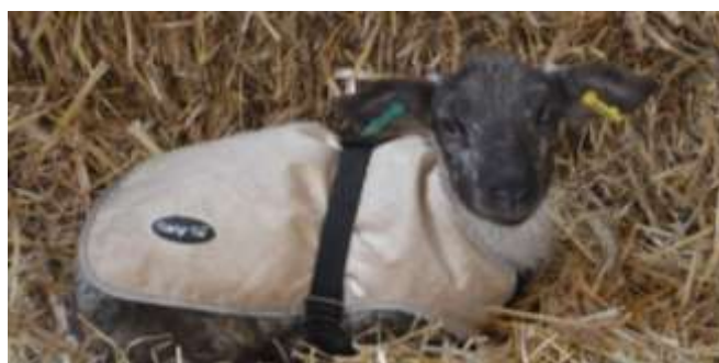
Figure 2. Lamb in jacket showing the fastening strap.