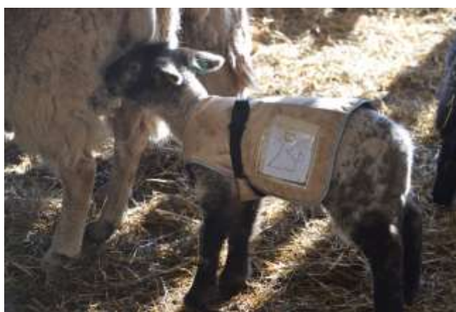
Figure 3. Lamb in jacket approaching two weeks of age; note the jackets appear short at that age but still functional.

First recordings were made prior to jacket placement (time ( t ) = 0). Sets of twins were allocated to groups alternately to balance time of lambing across groups. Lambs born to the same ewe were kept allocated to the same group to reduce risk of rejection of one lamb by the mother. Lambs were also balanced across groups for birth weight, with the average birth weight being 4.82 \pm 0.76 kg (Mean \pm SD) for group J and 4.89 \pm 0.59 kg for group NJ. Jackets were removed from group J after 14 days.