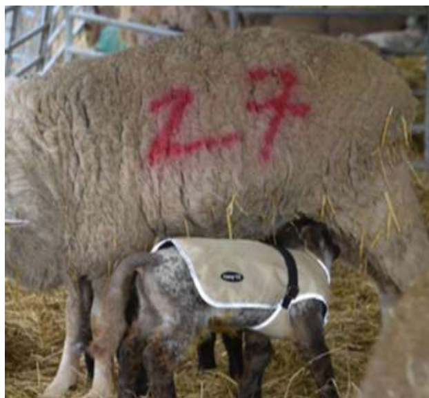
Figure 1. Lamb feeding while wearing the jacket (newborn).

On enrolment to the study (time ( t ) = 0), sets of twin lambs (i.e. whole litter) were allocated alternately in birth order in two equal groups ( n = 52 ): jacketed (J) (Figures 1–3) and non-jacketed (NJ). Jackets were waterproof with an outer shell made of 600D Oxford, 100 g filling and a nylon lining (Cosy Calf, Dorset, UK). The jackets were secured using the strap under the front legs shown in Figures 1–3. All jackets were sized “medium”.